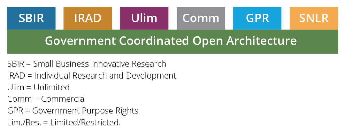
Figure 3: IP Strategy for Capability Modules