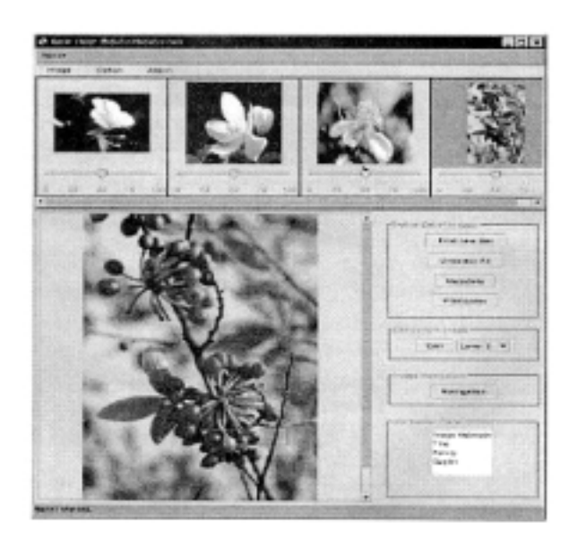
Figure 1. The MISE User Interface

Plug-ins Configurator [3]: which downloads dynamically image processing plug-ins such as image filters, edge detectors, colour detectors from the MediaSys Server and configures them in the applet according to the needs of the user. The Filter Configurator uses the Service Configurator pattern [17] to dynamically configure the image filters and image operation.