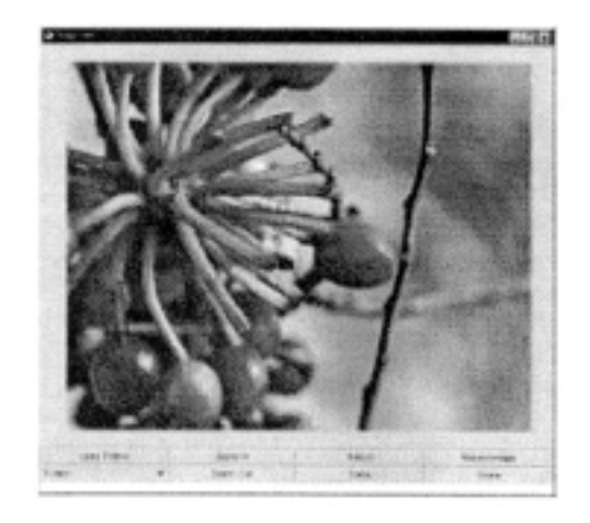
Figure 2. The Image Processing Tool

The search process is located at the server side. Its input consists of a set of sample images along with their associated weights as given by the user in the client applet. The purpose of the search engine is to retrieve an ordered list of images of decreasing similarity with respect to the user's choices. Classically, sample images with the highest weight, say 1.0, will always be retrieved (if they are in the database), whereas the ones with the lowest weight, accordingly 0.0, will never appear in the result list. A threshold has to be given in order not to retrieve about the whole database.