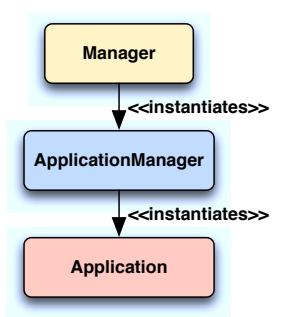
Figure 1: Architecture of the OMG D&C Specification

The runtime deployment infrastructure, shown in Figure 1 consists of a three-tier architecture that exists at two levels, i.e. , each node contains a NodeManager entity that acts as the front-end for management deployments on a single node, while a global ExecutionManager entity coordinates the actions of a set of NodeManagers to accomplish a distributed deployment.