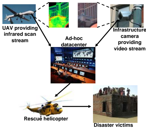
Figure 1: Search and Rescue Motivating Example

Search and rescue (SAR) operations help locate and extract survivors in a large metropolitan area after a regional catastrophe, such as a hurricane, earthquake, or tornado. Figure 1 shows an example SAR scenario where infrared scans along with GPS coordinates are provided by unmanned aerial vehicles (UAVs) and video feeds are provided by existing infrastructure cameras to receive, process, and transmit event stream data from sensors and monitors to emergency vehicles that can be dispatched to areas where survivors are identified. These infrared scans and video feeds are then sent to a dat-